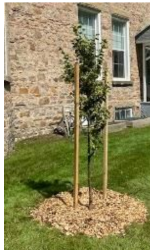
Greenspire Linden Tree in thanksgiving and hope for Thorneloe University