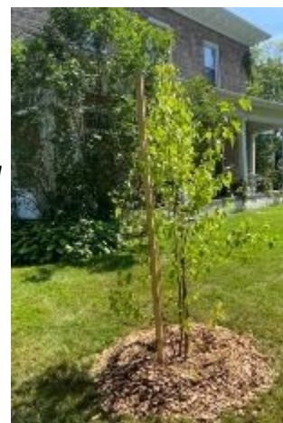
Whitespire Clump Birch (In remembrance of Covid-19 pandemic)