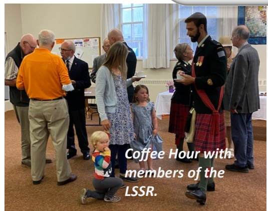
Coffee Hour with members of the LSSR.