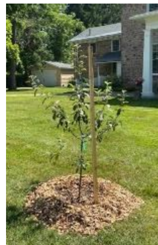
Gravenstein Apple Tree in gratitude for Lady Angela Burkett -Coutts - the English Baroness who gave the first gift of money to build Bishophurst in 1876