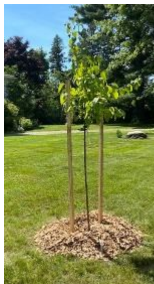
Ivory Silk Lilac Tree in joyful celebration of Her Majesty Queen Elizabeth 2nd Platinum Jubilee.

Are you planting a tree? Send in your pictures to socialmedia@gatheringtable.ca