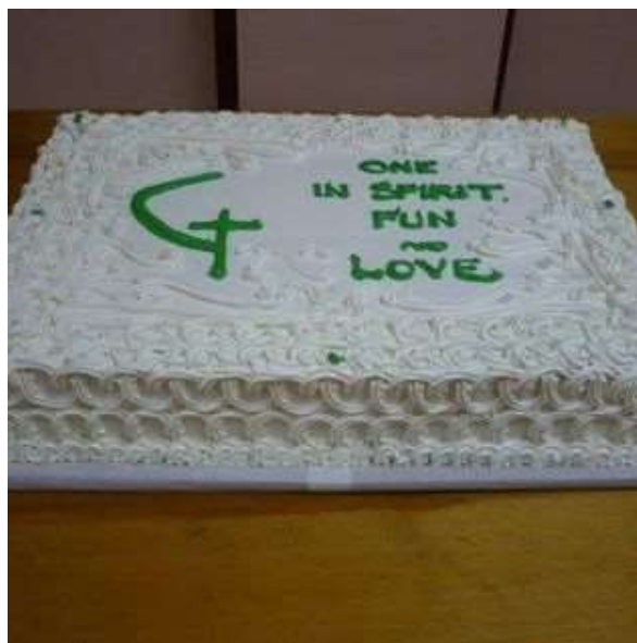
Camp Gitchigomee Sunday