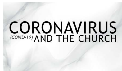
Table Talk via Zoom on Thursday, at 7 pm has begun. If you would like your name added to the existing list, please email the office by Tuesday. The reference materials will be emailed each week.