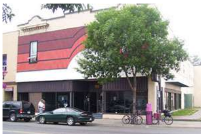
Grace Place Ministry