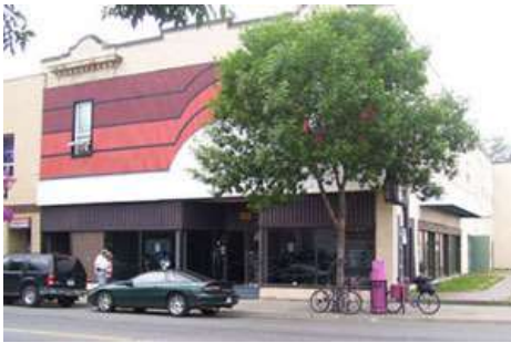
Grace Place Ministry